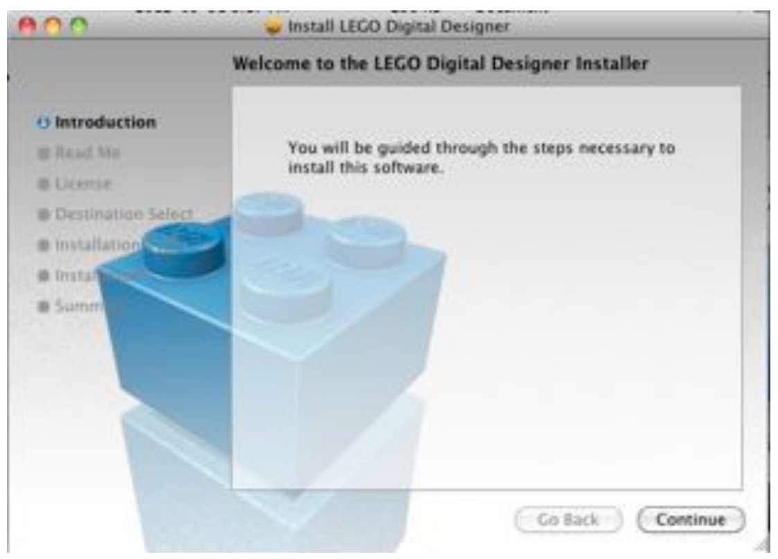
The Lego Digital Designer Installer

When the file is done downloading right click on it and chose show in finder from the menu. Downloads will come up with setupLDD-MAC-4_2_5.zip selected, double click on it and a file come out under it called LDD.pkg click on it to start the installation.